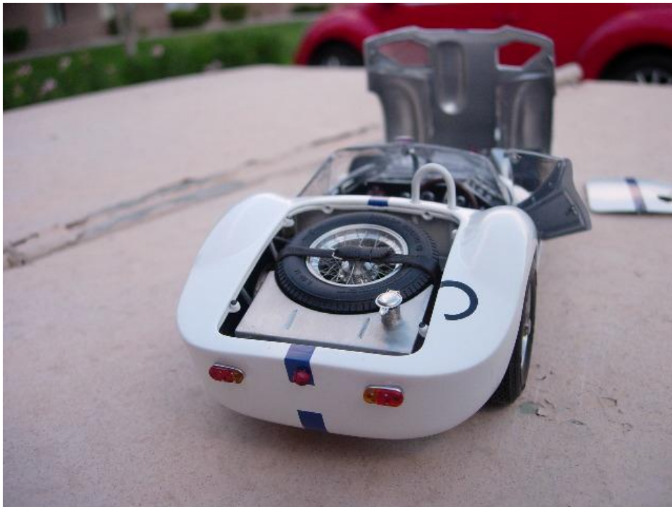
The deck lid removes to reveal an exquisitely reprised spare wheel and tire as well as the gas tank complete with opening cap. The spare is of course, removable, but this fumble fingers will leave well enough alone!