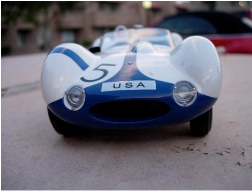
The shape is pure sex.