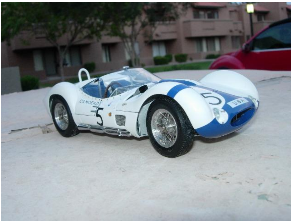
Even at rest, this Maserati looks restless and aggressive like the real thing, this model is a real winner!