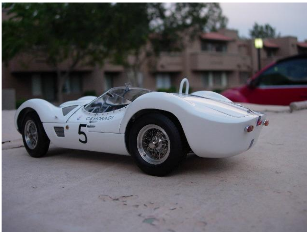
The interior is quite stark and business like.